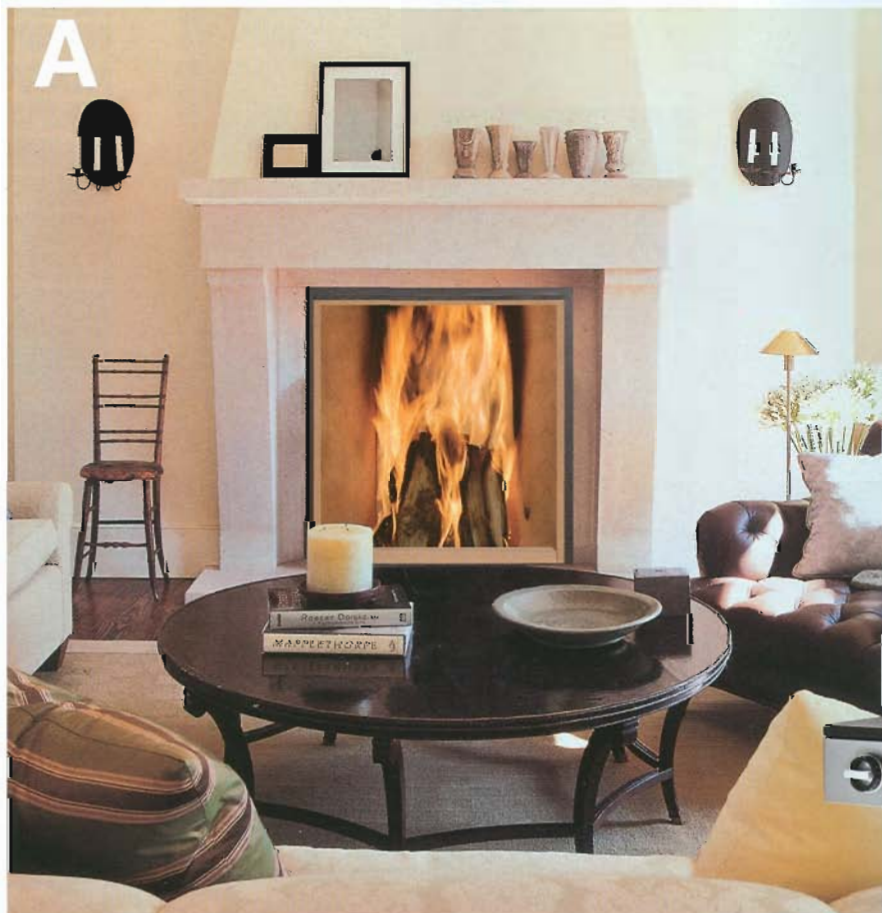
The Renaissance Rumford 1000 by ICC/RSF won three awards: the Vesta Challenge - Low-emission, Wood-burning Fireplace; Wood Fireplace; and the Daniel J. Melcon Award for Best-in-Show - Hearth Products.

Manual controls are weather-proof and the unit has wheeled mobility for added versatility and convenience. Call 1-888-88-FUEGO, visit www.fuegoliving.com or circle reader service number 101.