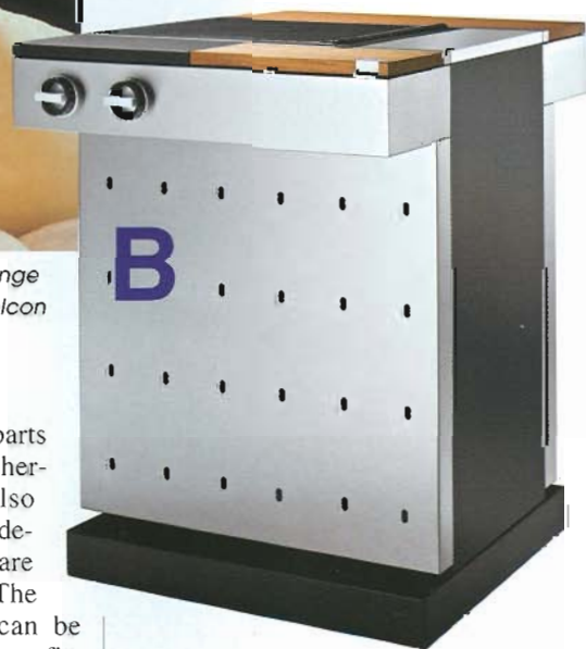
The Fuego 02 by Fuego North America won two awards: Gas Barbecues; and Best-in-Show - Outdoor Room Products.

burning fireplace. Mechanical parts disappear, leaving a gorgeous herringbone firebox. The RR also incorporates a guillotine-style hideaway door and firescreen that are engineered to last a lifetime. The door moves so smoothly it can be opened and closed with just one finger. Call (450) 565-6336, visit www.icc-rsf.com , or circle reader service number 100.